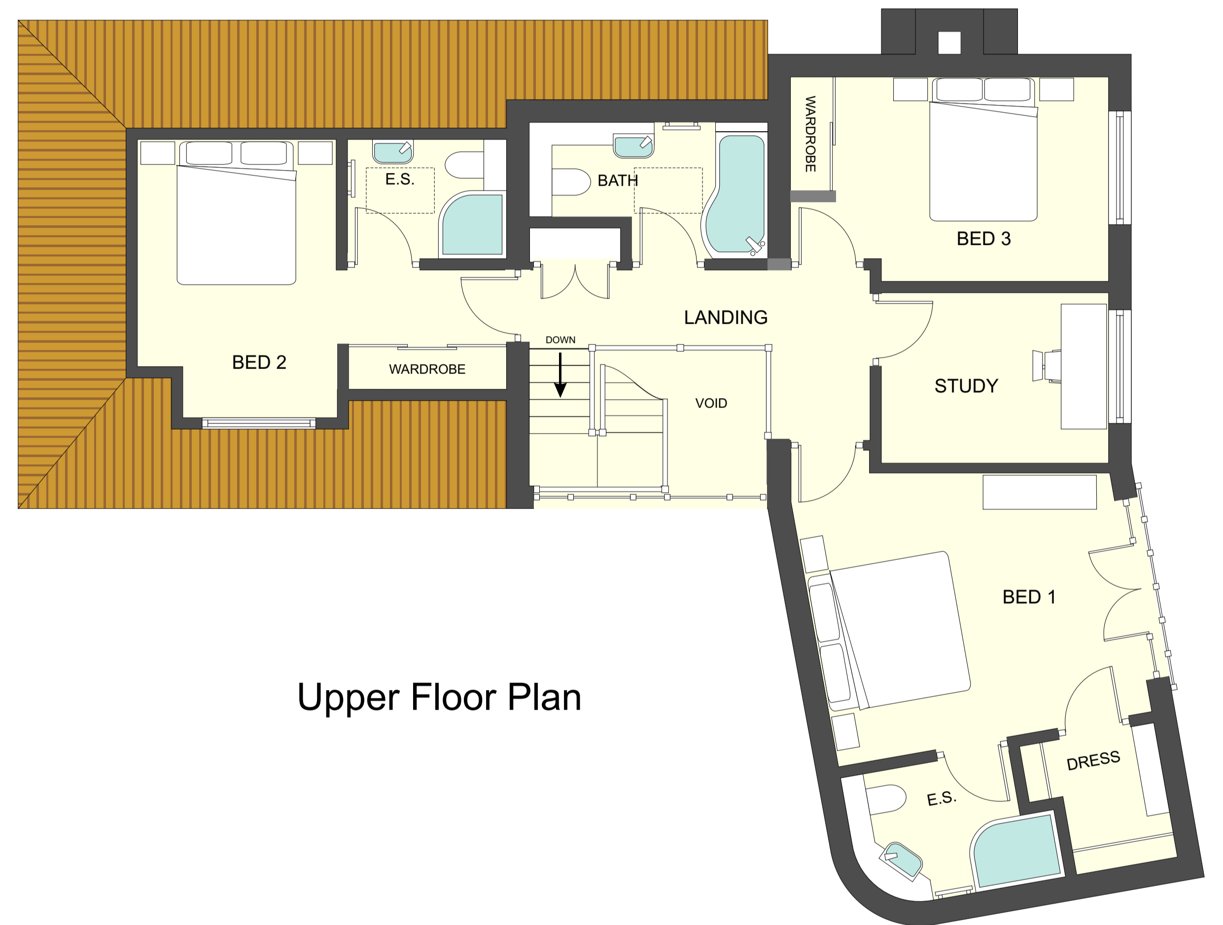
Upper Floor Plan